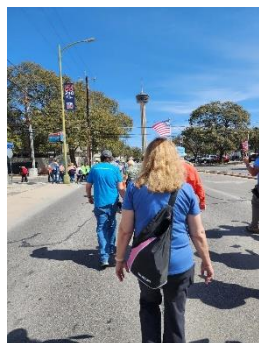
Walkers with Hemisphere Tower