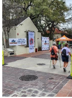
Walk Finish Point