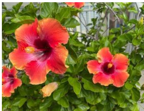
7 May at Winter Park (Mead Garden)