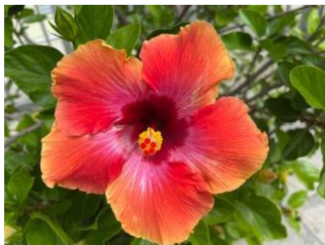
30 April at Celebration #2