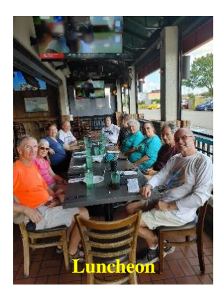
15 January at Orlando Downtown