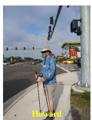
26 March at Lakeland