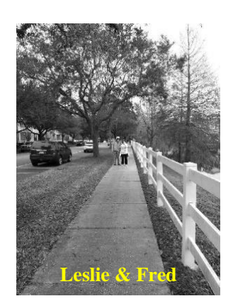
19 February at The Villages (Lake Sumter)