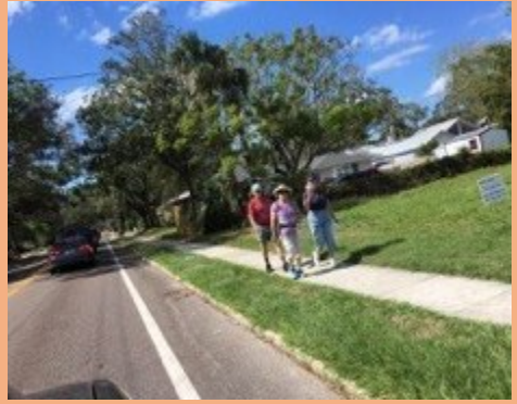
Walking to Vilano Bridge