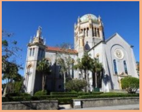
Historic Walk Presbyterian Church