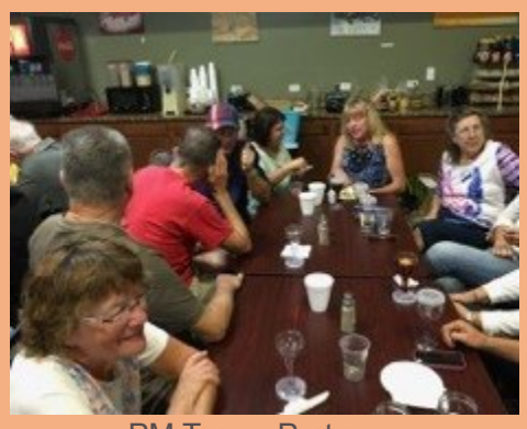
PM Tapas Party