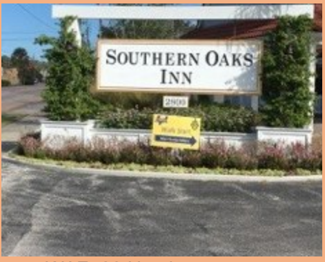
WAF -26 Headquarters