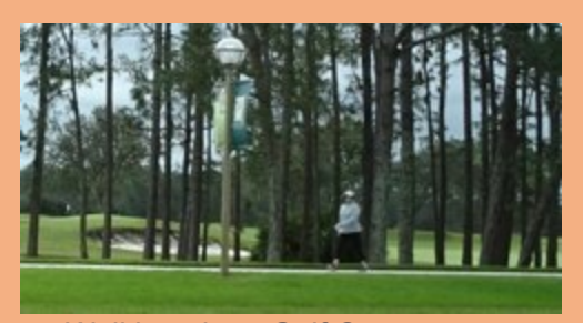
Walking along Golf Course