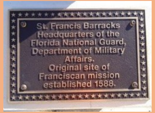
St Francis Barracks