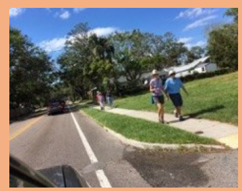
Walking to Vilano Bridge