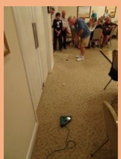
Putting for Spain