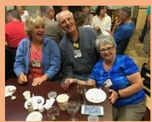
10-27 PM Tapas Party (10)