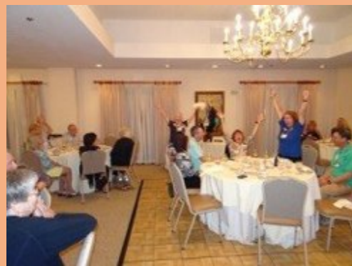
Contest Winners - Great Britain