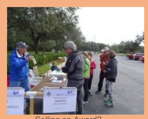
Selling an Award?