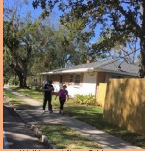
Walking to Vilano Bridge