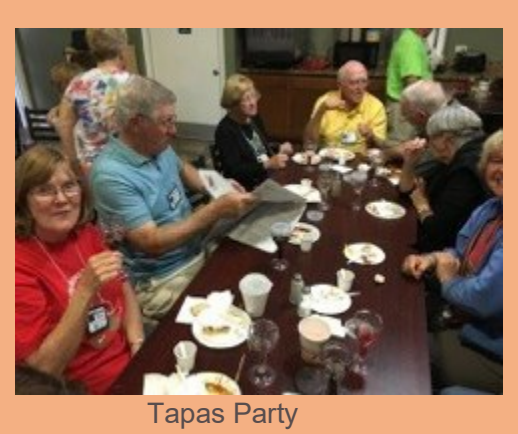
Tapas Party (2)