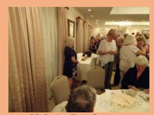
GB Getting Their Gold