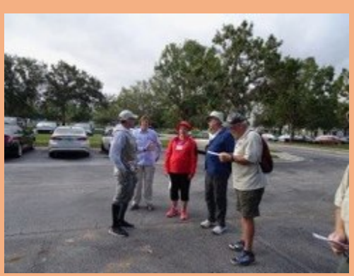
Waiting to Start