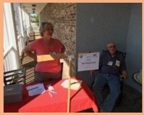
Non Registered Table