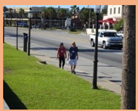
Lion's Bridge Walk