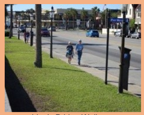
Lion's Bridge Walk