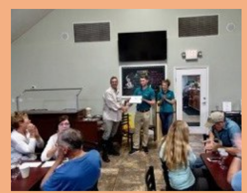
Cert Appreciation to Hotel