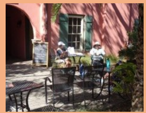
Check In & Finish