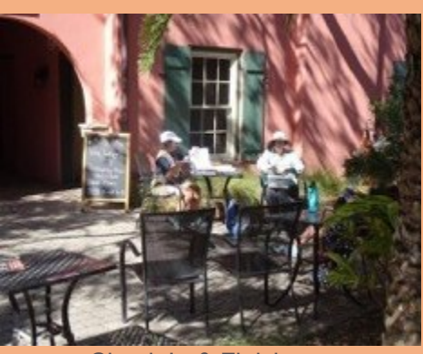
Check In & Finish