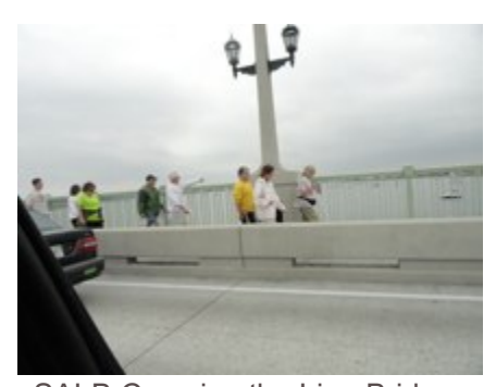
SALB Crossing the Lion Bridge