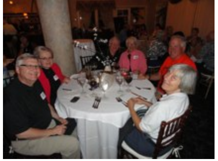
A1A Aleworks Dinner Table 1