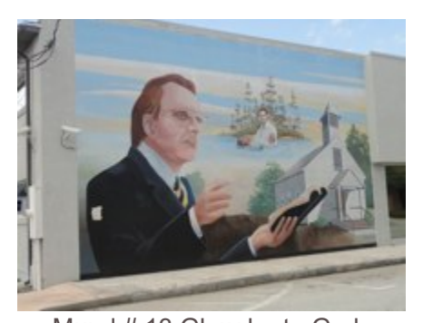
Mural # 13 Glory be to God