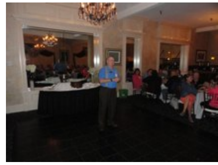
AVA VP Speaks