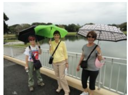
Walkers with liquid sun protection