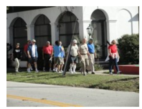
Walkers at US 17