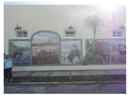
Mural # 15 Putnam Treasures