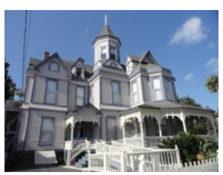
House on Emmett