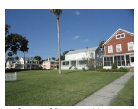
Corner of River and Morris: houses