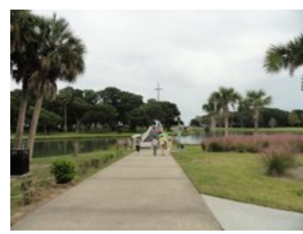
The Shrine Area