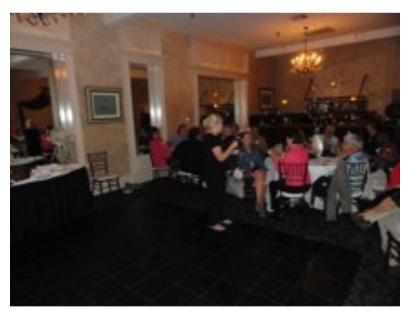
Alice Raffles Awards 2