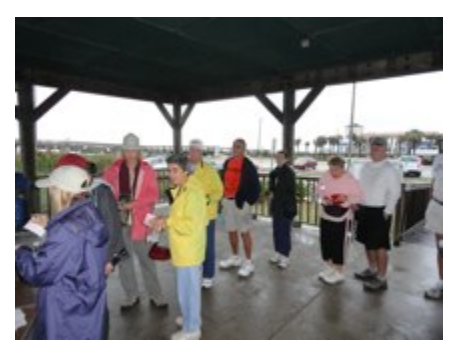
SAB - will it stop?