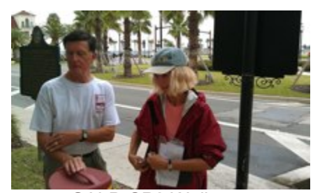
SALB CP2 Walkers