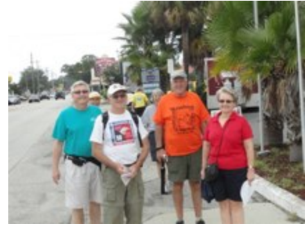
Southeast RD and Friends