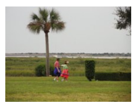
Walkers SA Walk