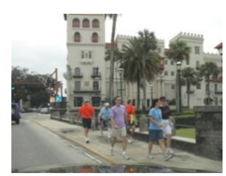
SALB Walkers @ Casa Monica