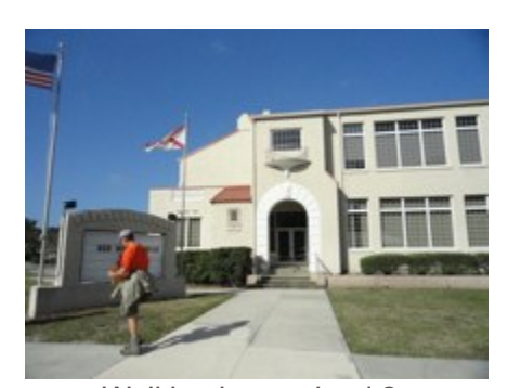
Walking by a school 2