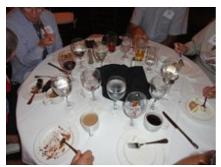
Is it Gone?