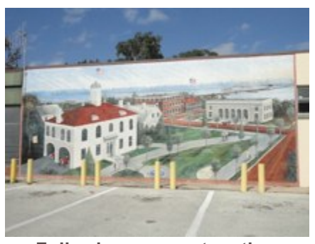
Following were not on the Route: Mural # 7 Heartbeat of Palatka