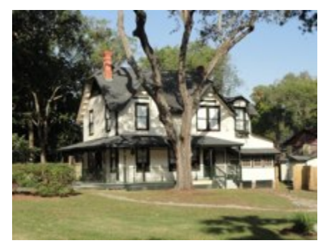
House on 2d. Street