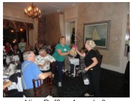
Alice Raffles Awards 3