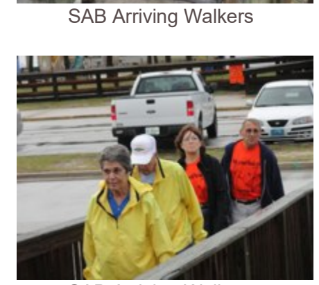
SAB Arriving Walkers