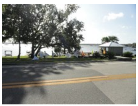
More Halloween Spirit