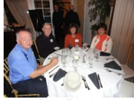
Dinner Table 2