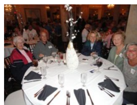
Dinner Table 4