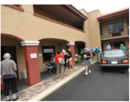
The Walkers Get Started