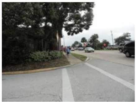
SALB Walkers on Ponce?