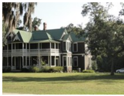
House on Walk 2