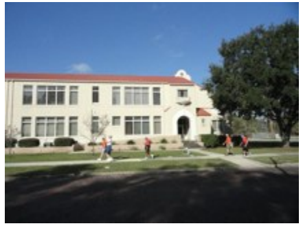
Walking by a school