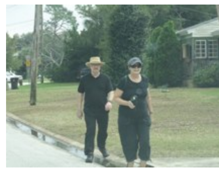
SALB Walkers on Arricola