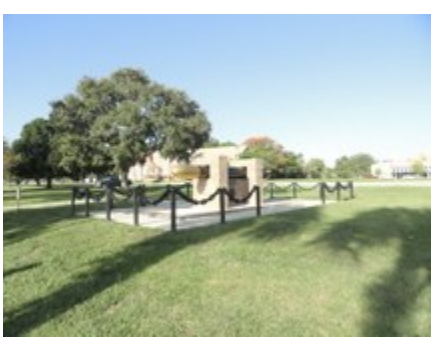
Navy Torpedo Memorial