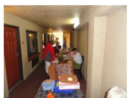
St Augustine Lion Bridge & Lighthouse (SALB) Start