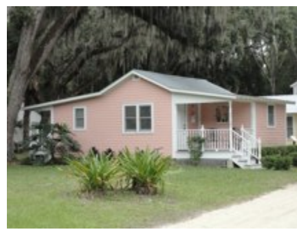
SA YRE House