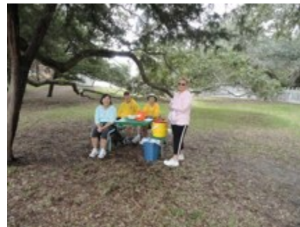
SALB CP 2 at Lighthouse