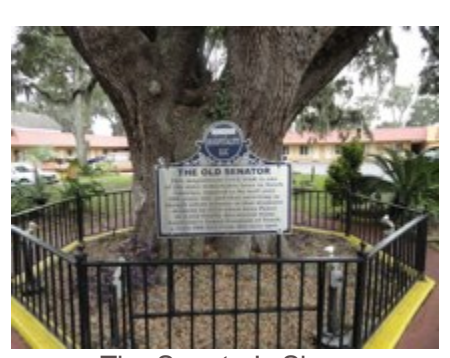
The Senator's Sign