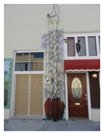
Right of Mural # 15