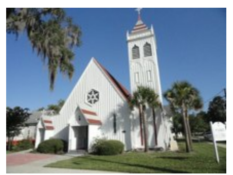
St Marks on Main and 2d