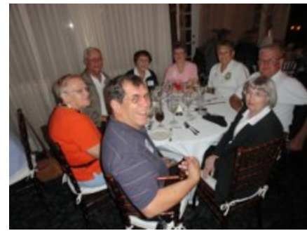
Dinner Table 8