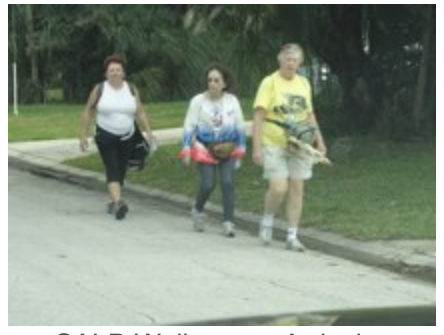
SALB Walkers on Arricola