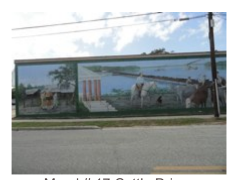
Mural # 17 Cattle Drive