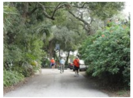
SALB Walkers on Loring