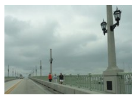
SALB Bridge walkers