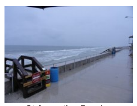
St Augustine Beach (SAB) high Tide