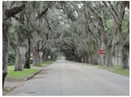
The Scenic Road by Fountain of Youth