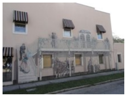
Mural # 14 Bygone Days