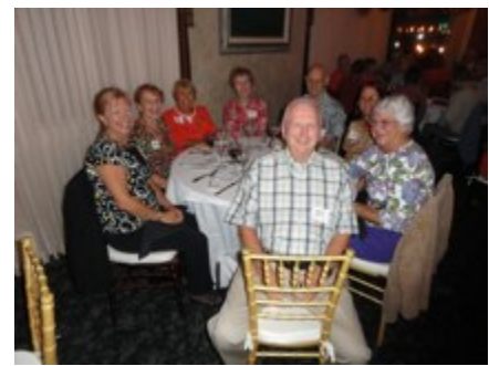
Dinner Table 3