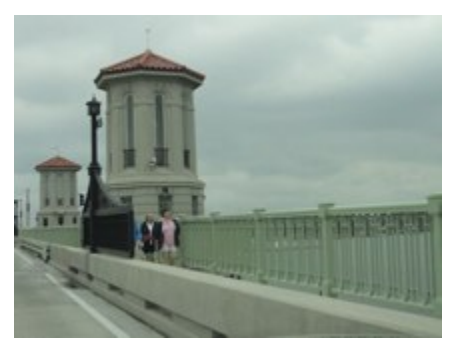
SALB Bridge walkers