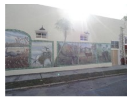
Mural # 15 Putnam Treasures 2