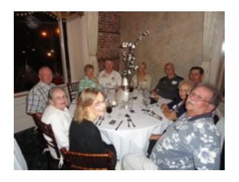
Dinner Table 9