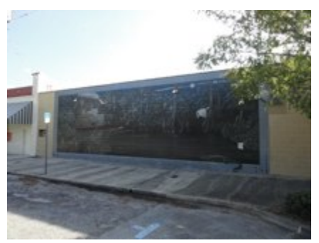
Mural # 12 Night Passage