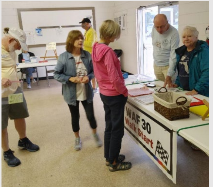
New Smyrna Beach Start