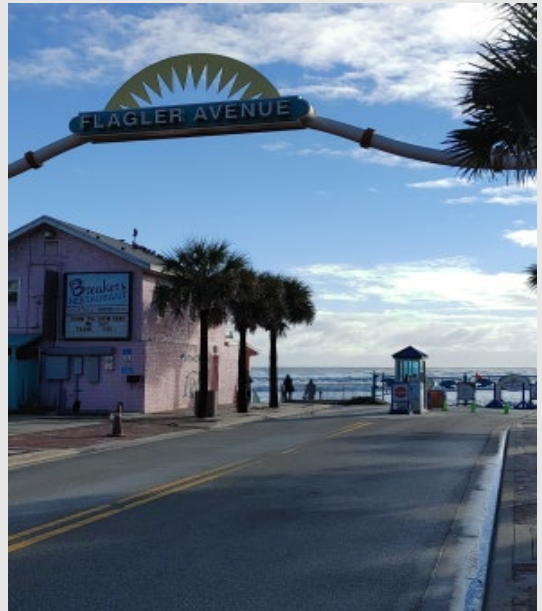
Flagler Ave Sign