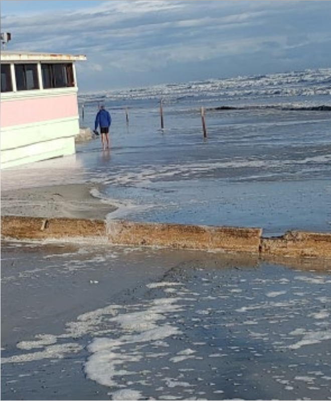
NSB Walk High Tide After Storm