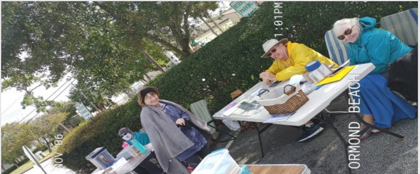
Ormond Beach Finish