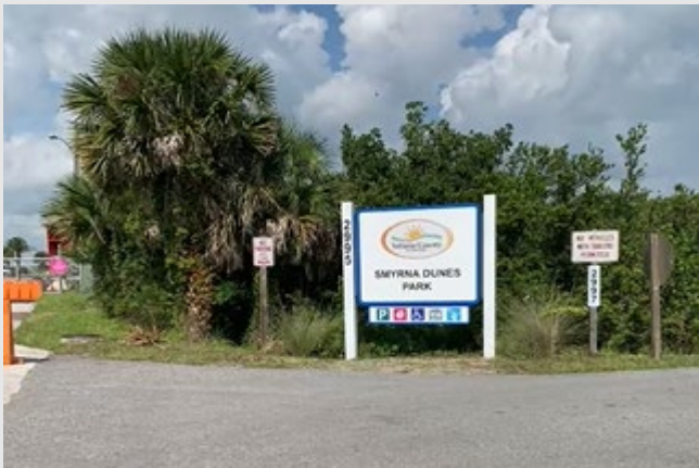
Smyrna Dunes Park