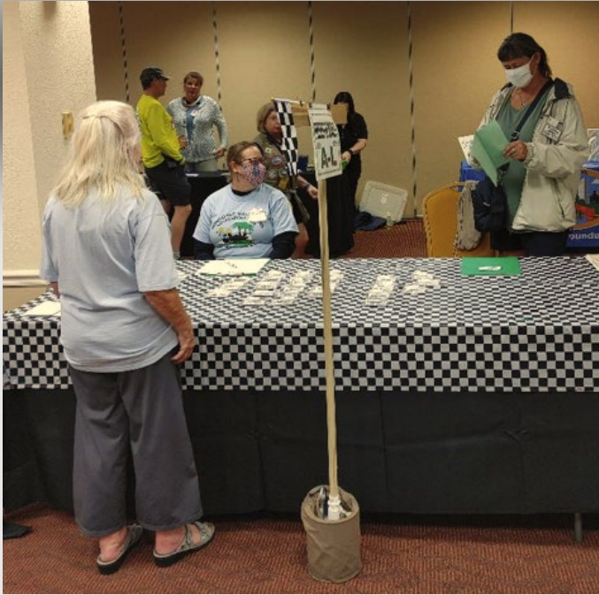
Registration Central Friday, November 5 th