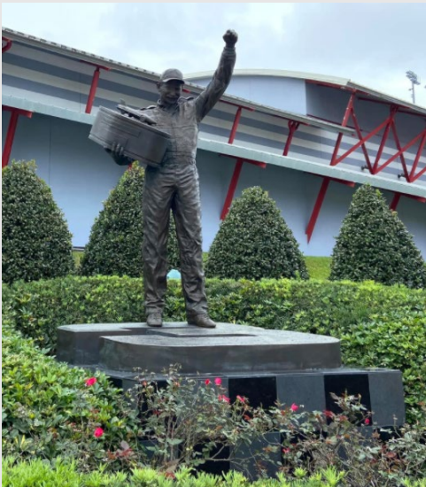
Dale Earnhardt Sr.