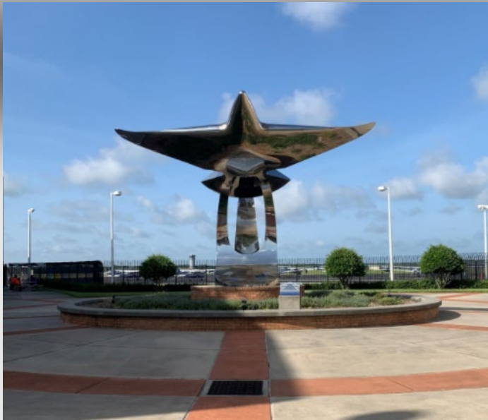
Pathways to the Sky