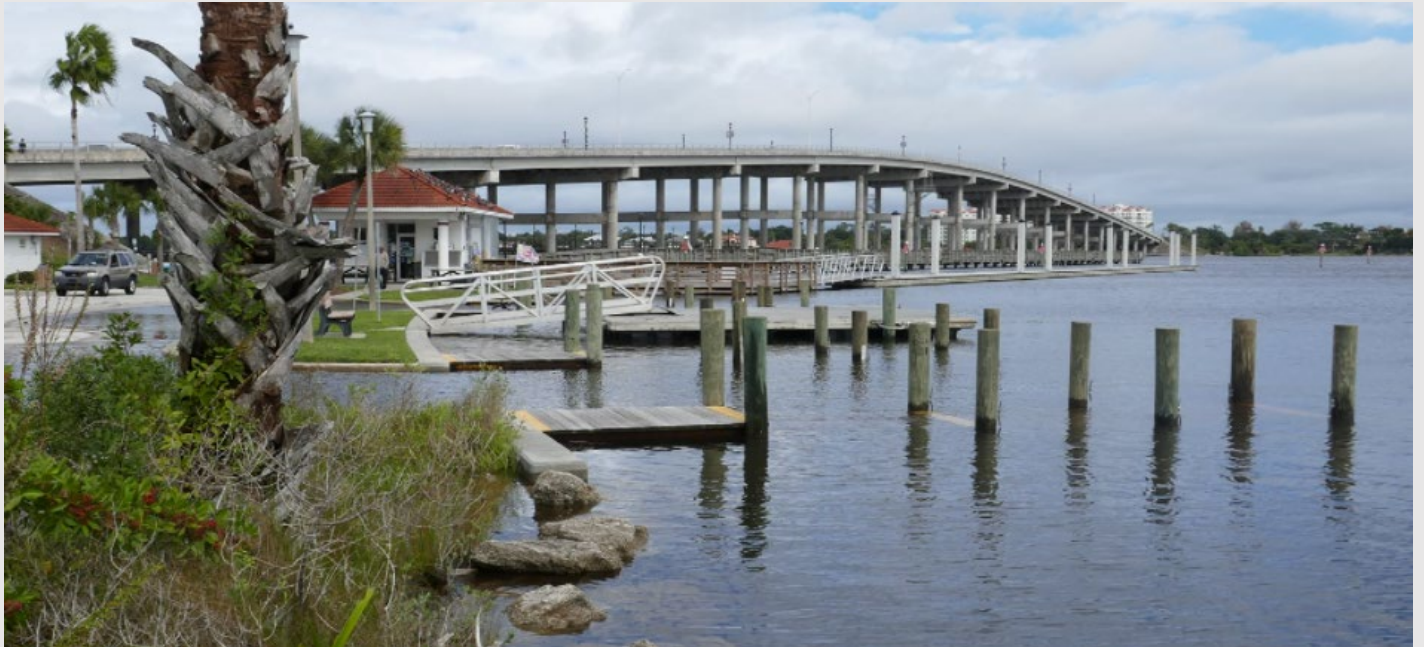
Ormond Beach Bridge