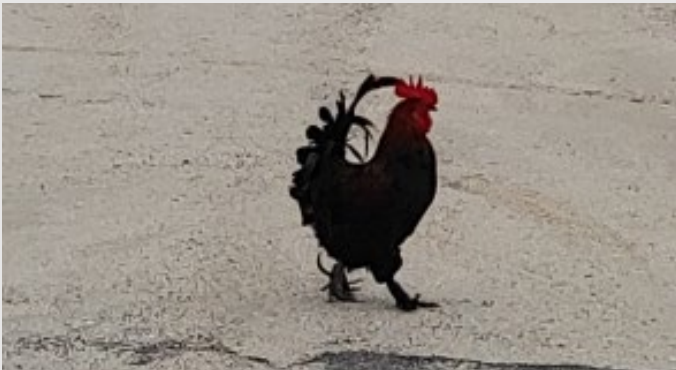
NSB Walk Mascot