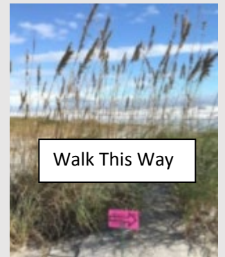
Walk This Way