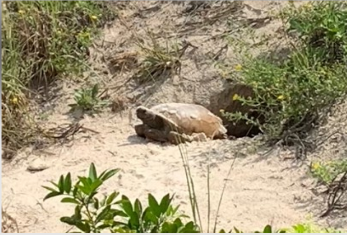
Coming Out For A Walk