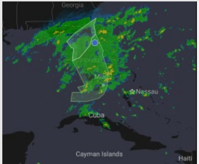
Radar November 5th