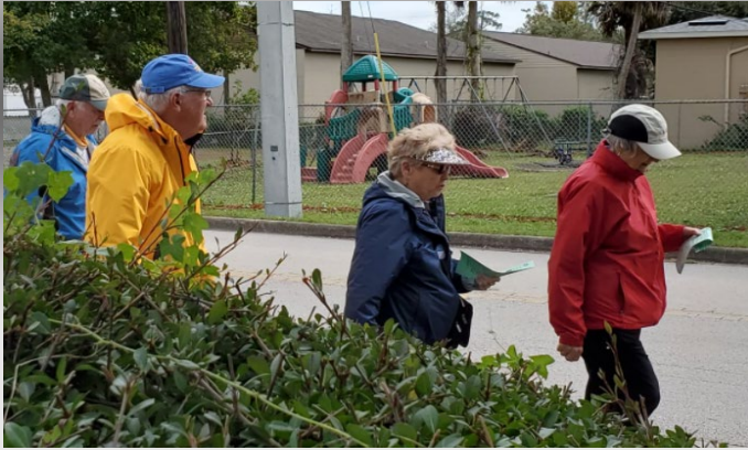
The Albany Team