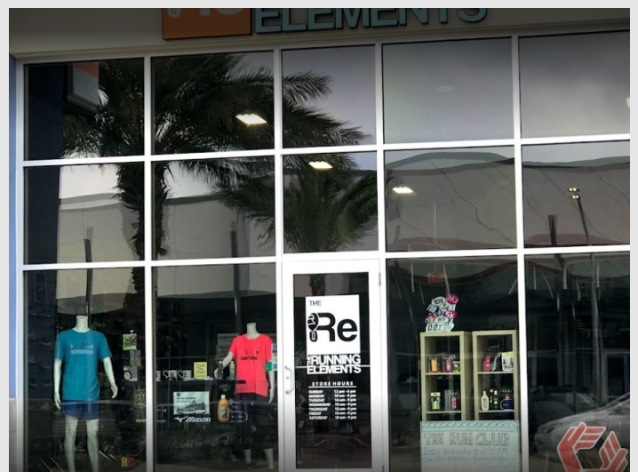
Running Elements Walk Start

One Daytona Walk International Speedway Embry Riddle Aeronautical University