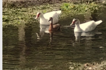
Birds Along the OB Walk