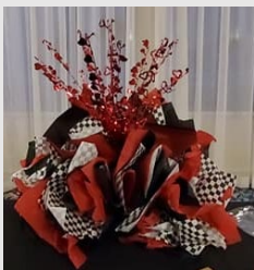
Centerpieces for the Tables