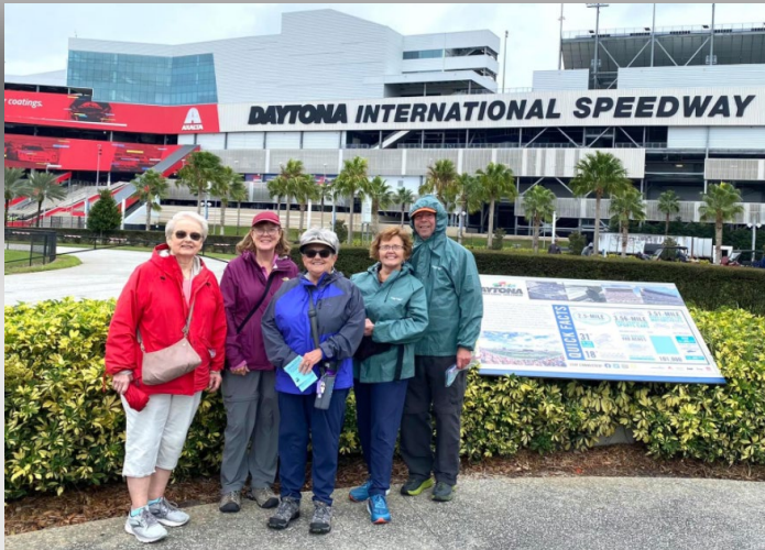
Walkers at the Speedway