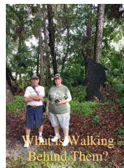
What is Walking Behind Them?