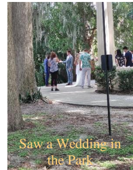
Saw a Wedding in the Park