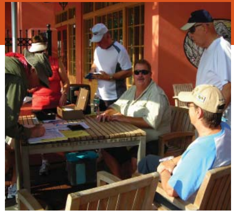
Registering for the Celebration walk at Starbucks

We have some nice walks you will enjoy the next 2 months. The Minneola walk on the Lake County Trail into Clermont and in the nearby neighborhood should be fun as we