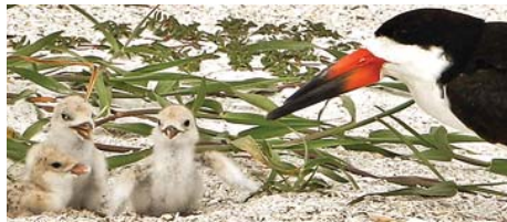
Suncoast Seabird Sanctuary