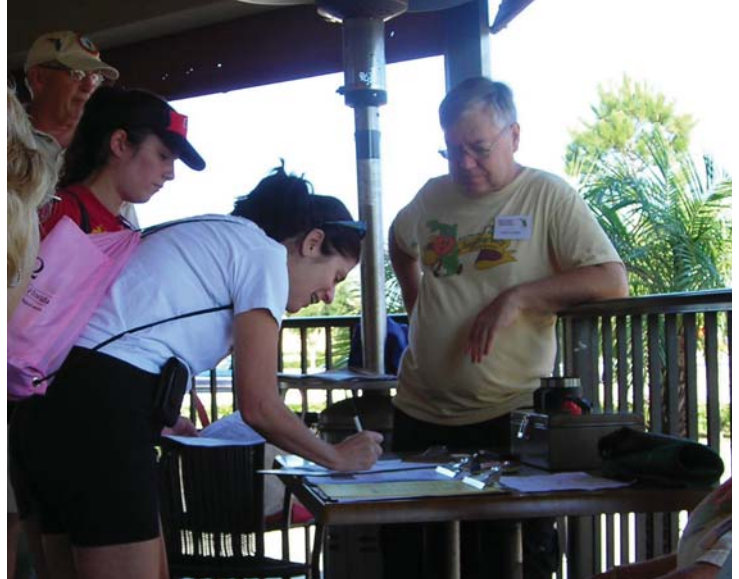
Walk registration at Kahuna Grill, Hunters Creek