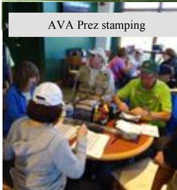
AVA Prez stamping