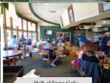
Hall of Fame Cafe