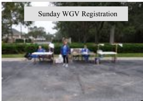
Sunday WGV Registration