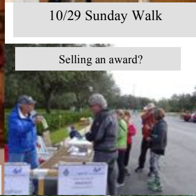
Selling an award?