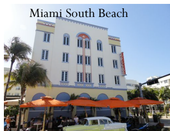
Miami South Beach