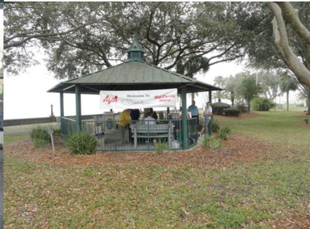
Eustis start gazebo at Ferran Park