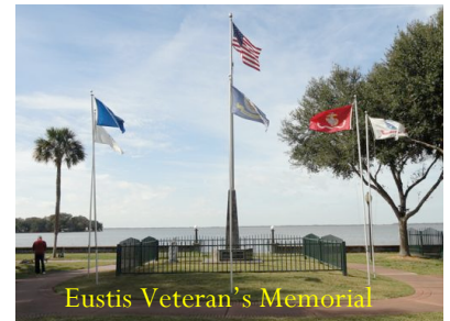
Eustis Veteran's Memorial