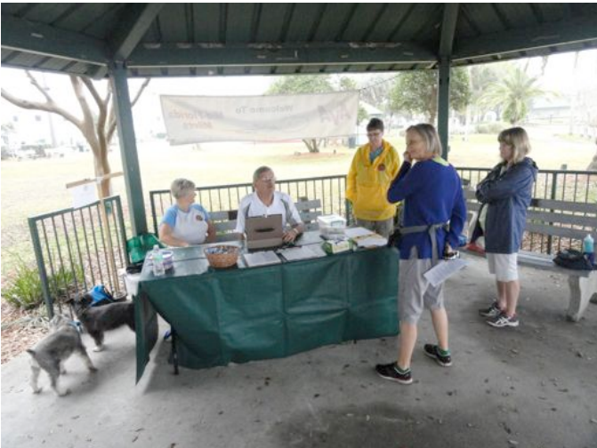
Kaitschucks volunteering at start, supervised by???